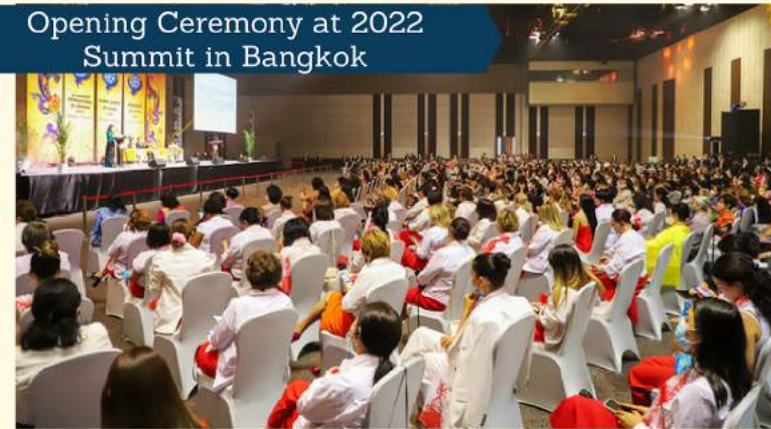
Opening Ceremony at 2022 Summit in Bangkok