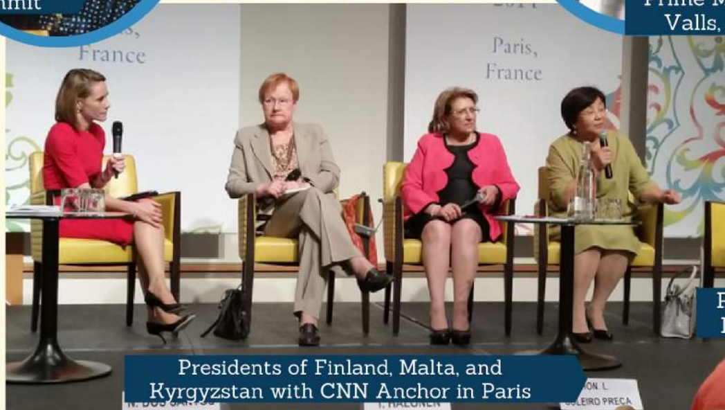
Presidents of Finland, Malta, and Kyrgyzstan with CNN Anchor in Paris