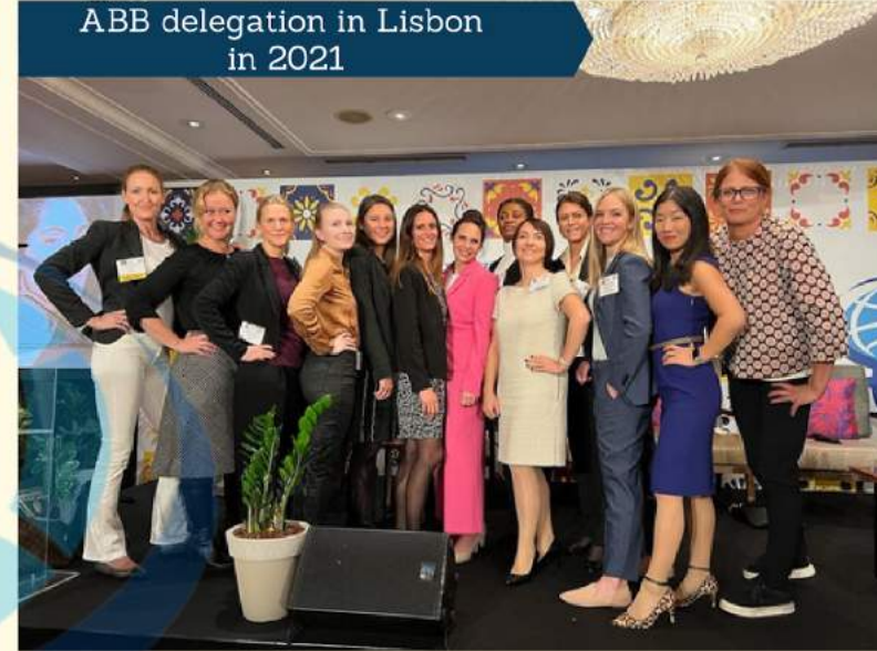
ABB delegation in Lisbon in 2021