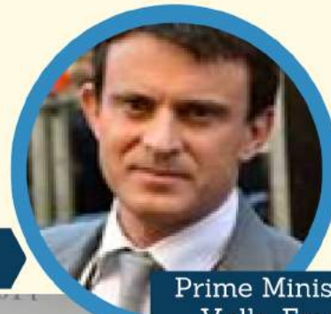
Prime Minister Manuel Valls, France, 2014