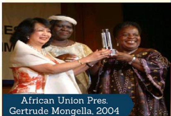
African Union Pres. Gertrude Mongella, 2004