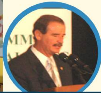
President Vicente Fox, Mexico, 2005 Summit