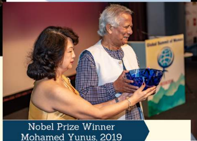
Nobel Prize Winner Mohamed Yunus, 2019