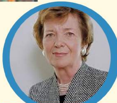
Mary Robinson, President of Ireland, 1992 Summit