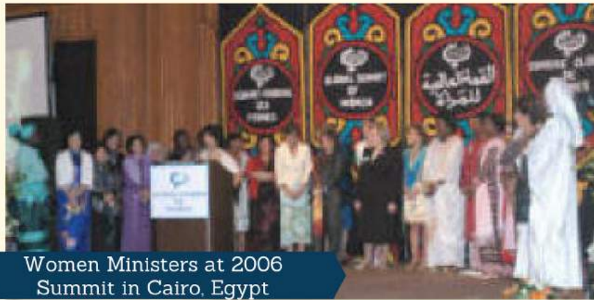
Women Ministers at 2006 Summit in Cairo, Egypt