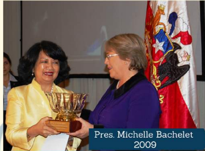
Pres. Michelle Bachelet 2009