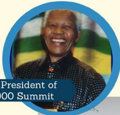
Nelson Mandela, President of South Africa, 2000 Summit