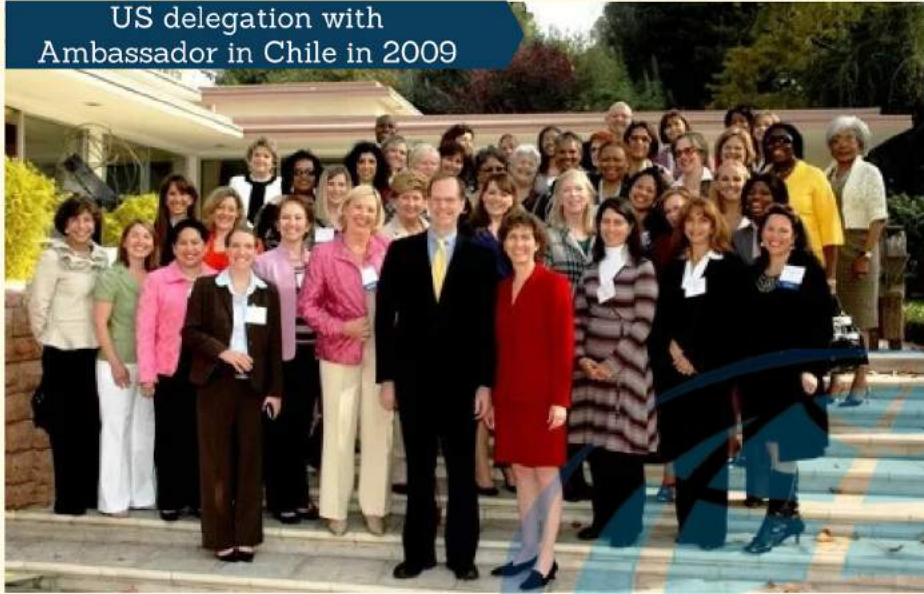
US delegation with Ambassador in Chile in 2009