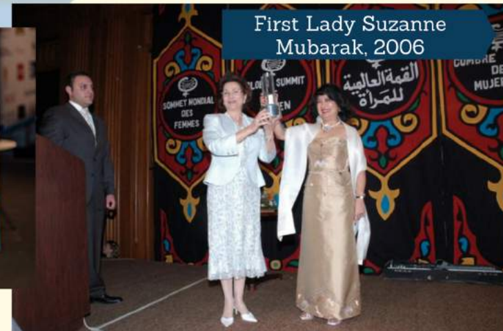
First Lady Suzanne Mubarak, 2006