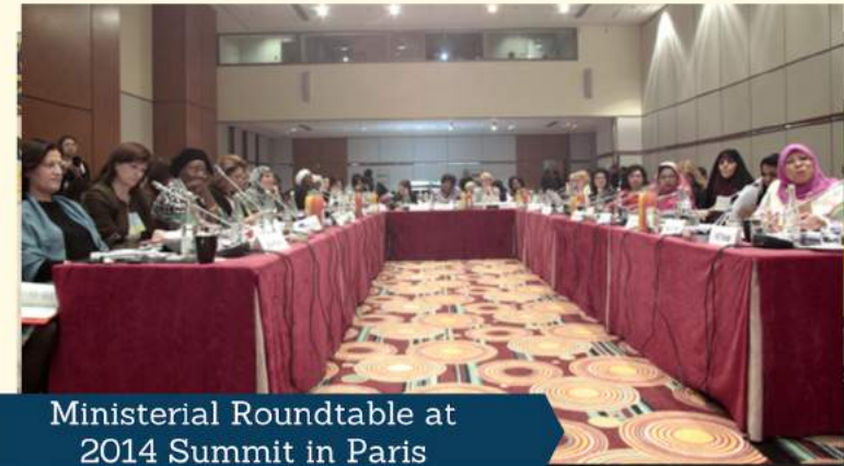
Ministerial Roundtable at 2014 Summit in Paris