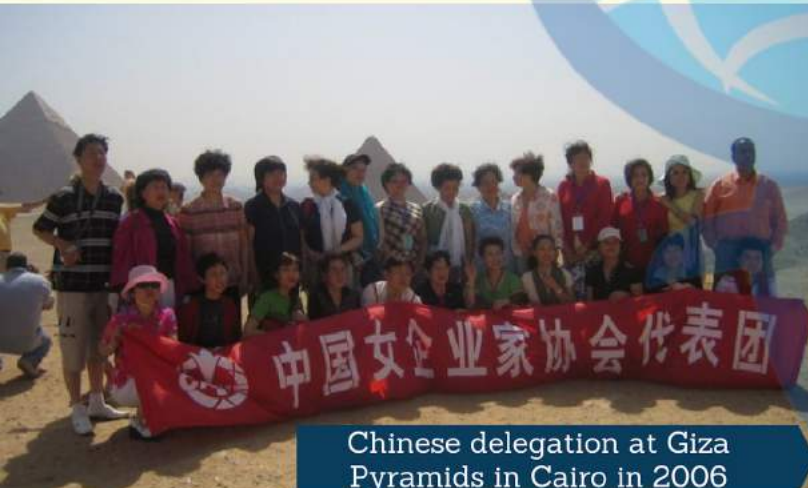
Chinese delegation at Giza Pyramids in Cairo in 2006