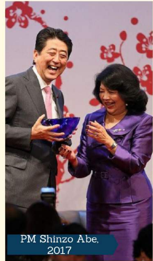
PM Shinzo Abe, 2017