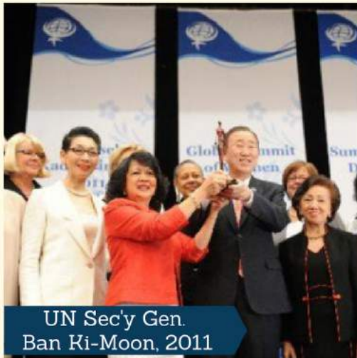
UN Sec'y Gen. Ban Ki-Moon, 2011