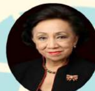
Delia Domingo-Albert Former Secretary of Foreign Affairs (Philippines)