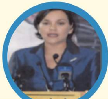
Princess Leila Hasna, Morocco, 2003 Summit